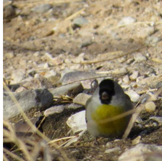
Lawrence’s Goldfinch (male) – Tellbrook Park) 12/15/2018 Evelyn Treiman

owner on 12/17/18 at 4 Hills neighborhood) are below.