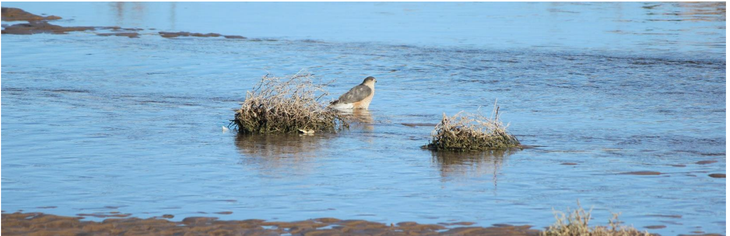
Sharp Shinned Hawk at El Paso's Rio Bosque Park (Socorro), during MVAS field trip on 1/29/2018

Or, maybe you have another idea. Take a minute or two to let me know and I'll see what we can do. Please get me your suggestions by 5 pm on Friday April 5th. I'll tally them over the weekend, and on Monday the 7th I'll announce our April field trip destination. Please email your suggestions to mpndltn@gmail.com and put MVAS Apr FT in subject line.