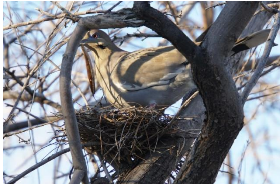
Nesting White Winged Dove, Tellbrook Park 1/16/2019. It looks like they will be with us at least another year!

You can be a citizen scientist, just for the fun of it.