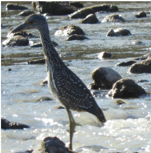
juvenile yellow-crown night-heron, 8/4/2018. CJ Goin

The list below includes our currently scheduled locations, with the dates for the upcoming three months. You can “ control click ” or “ tap ” on the included web reference and be directed to the eBird.org web page that will have a list and pictures of the most recent birds seen as well as a Google map to help you find its location. It allows you to come prepared!