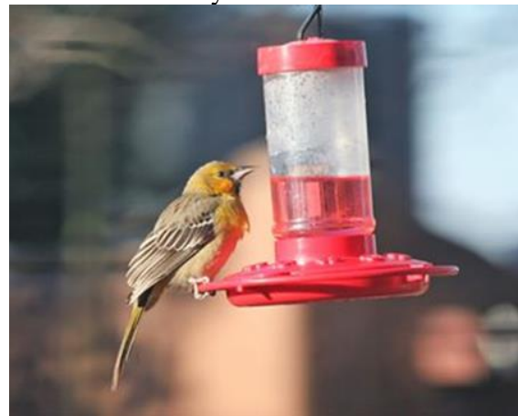
Bullock’s Oriole (seen at a private residence by owner on 12/17/18 at 4 Hills neighborhood)

I would like to thank all the birders who gave of their time to bird in the 2018 Las Cruces CBC. I especially want to thank our team leaders. Without their planning and organizing of their teams, our CBC would not even be possible.