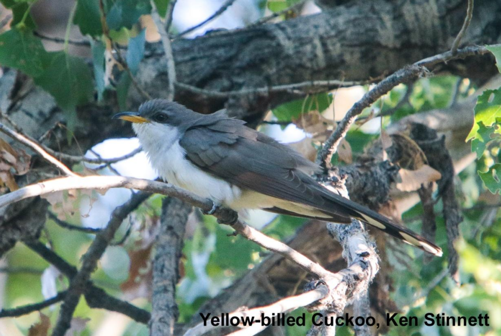
Yellow-billed Cuckoo, Ken Stinnett