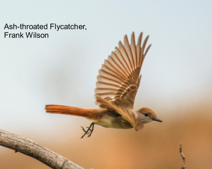
Ash-throated Flycatcher